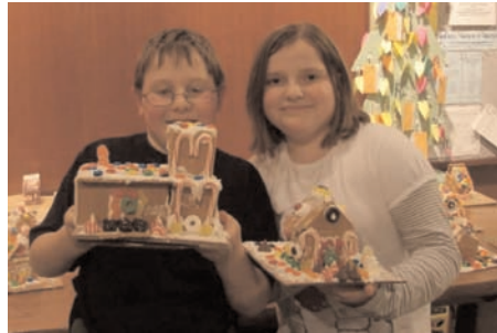
Gingerbread house making ...