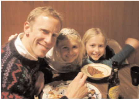
a potluck ...