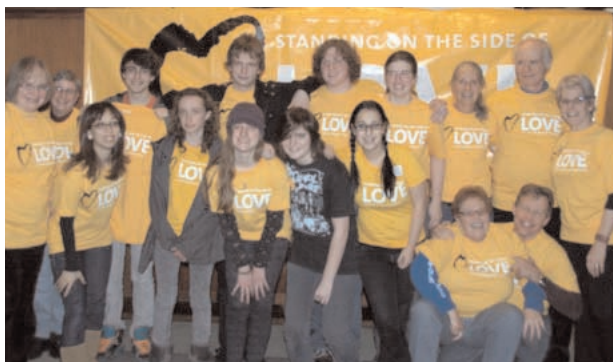
The Rainbow Task Force

I want to help people understand that (to reference a great children's author) a person's a person, no matter how queer. I also want to help LGBT children, teens, and