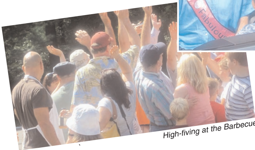
High-fiving at the Barbecue