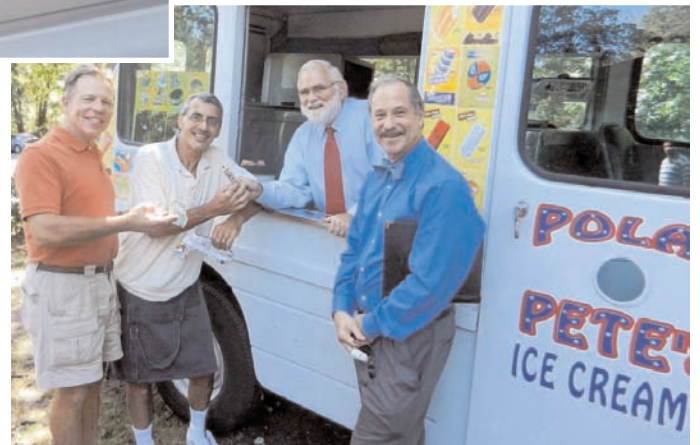
The Ice Cream Man cometh!